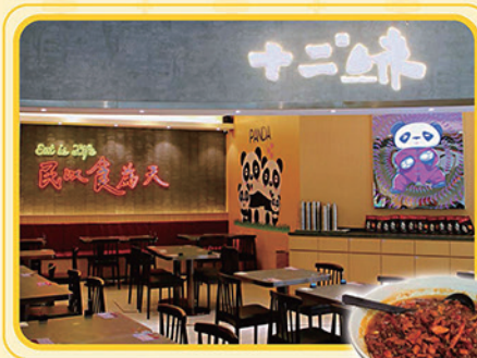
Twelve Flavors Shop G28 & 28A