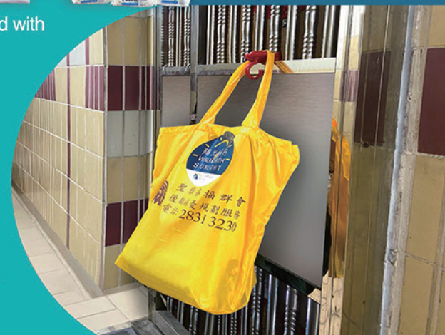
▲ Goodies bag for the elderly

To spread our love and share the joy of the Mid-Autumn Festival, we have teamed up with St. James' Settlement to distribute 800 goodies bags to the elderly. The goodies bags contain moon cakes, instant oats, face masks and disinfectant wet tissues. As face-to-face contact is not advisable under the social distancing guidelines, our staff volunteered to make telephone calls to the elderly recipients and bring a heart-warming cheer to them.