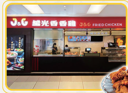
J&G Fried Chicken Shop 2002-2003