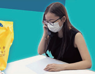
▲ Caring calls to the elderly

Apart from our passion and commitment to caring for the people working for and with us, caring for the community is always at the heart of our values.