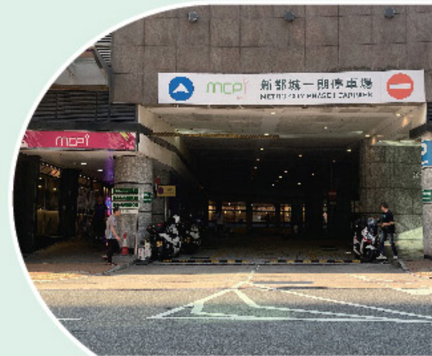
▲ MCPI carpark