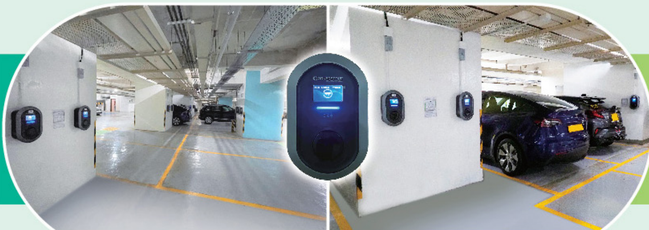
▲ 28 designated EV parking spaces are located on 1/F of MCPI carpark

The new EV charging facilities symbolizes Sunlight REIT’s determination to help reduce carbon footprint and foster sustainable energy in the community. Stay tuned as we will step up our effort in installing more EV charging stations across Sunlight REIT’s property portfolio in the near future.