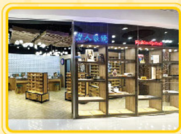
Fashion Optical Shop 274