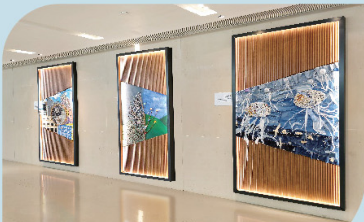
▲ Outstanding entries of recycled art piece competition displayed at DSFC

Thanks to YMCA’s coordination for a series of sustainable art and design activities including the workshops to engage participants with local artists, delving into the world of installation art. The programme culminated in an art piece design competition with competing teams creating artworks by using recycled materials, and the outstanding entries are currently displayed at the lobby of DSFC.