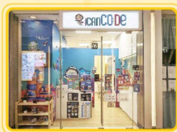
ICanCode Shop G46