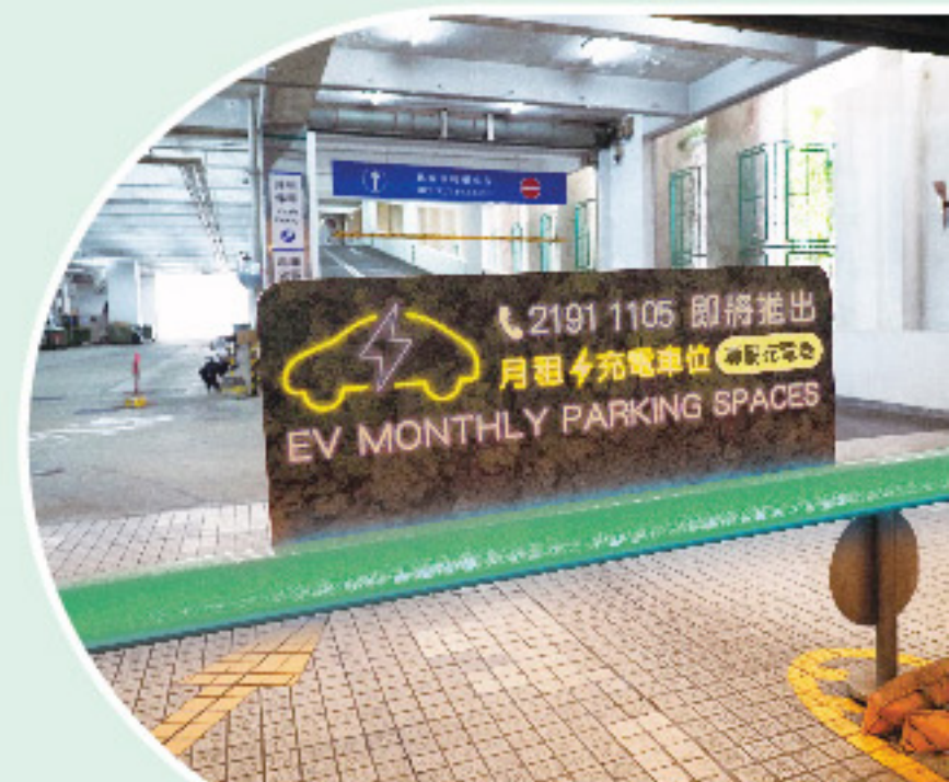
▲ EV parking scheme

We extend our momentum of sustainability initiatives by launching 28 electric vehicle (“EV”) charging stations at the car park of Metro City Phase I Property, representing one of the most extensive EV charging facilities in the Tseung Kwan O vicinity.