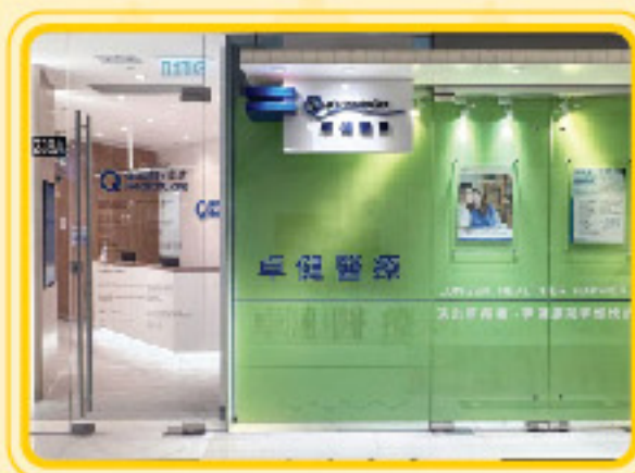
Quality HealthCare Shop 238A