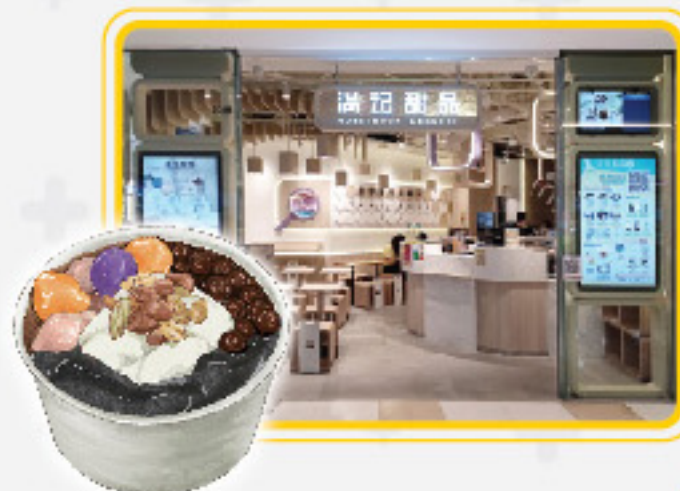
Honey moon Shop 2201