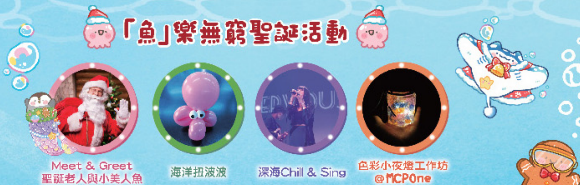
Meet & Greet 聖誕老人與小美人魚