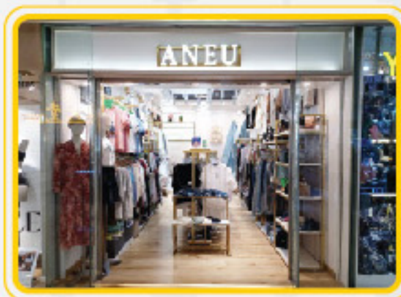
ANEU Fashion Shop 2106