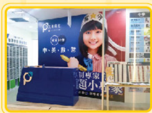
Popular Learning Shop G85 & G90